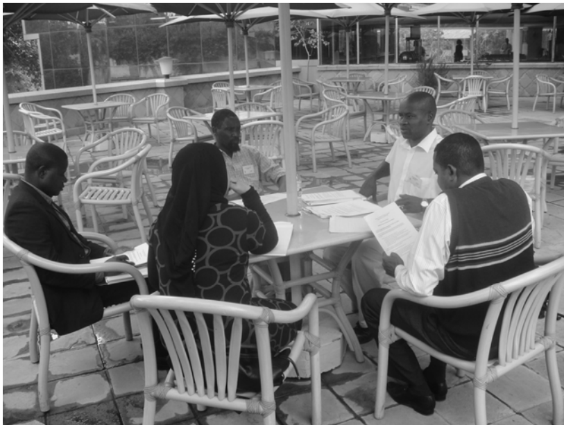
Working group session (above) Field trip to Tarangire National Park (left). Participants asking questions during the field trip (next page)

Participants also benefited from explanations and discussions provided during the field visit organised in the Tarangire National Park in collaboration with the Tanzania National Parks (TANAPA) .