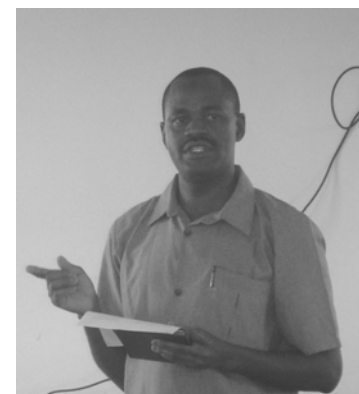
Explanations provided by TANAPA staff in Tarangire National Park