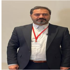
Reza Arefpajooi Razi Vaccine & Serum Research Institute – Iran Regional expertise in vaccine & diagnostic development